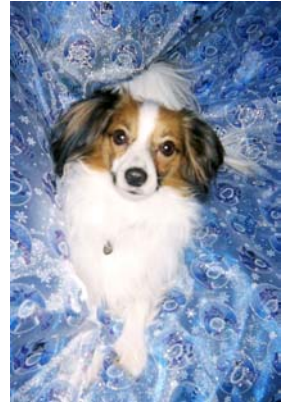
Magic on snowmen