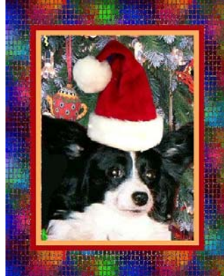
Mickey's Santa Hat